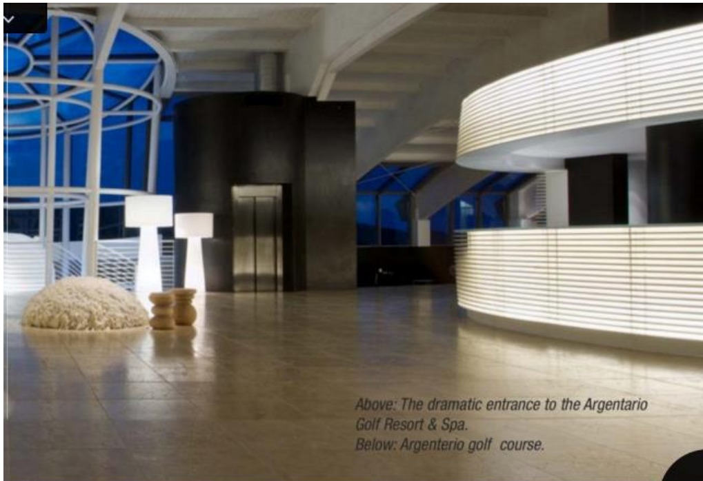
Above: The dramatic entrance to the Argentario Golf Resort & Spa. Below: Argentario golf course.